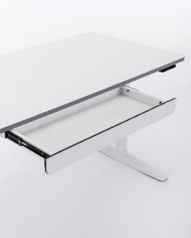
Optional felt lined drawer