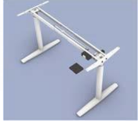
Double telescopic support beam construction to ensure stability