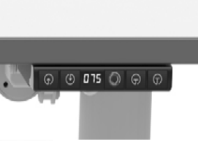
LED display handset with 2 memory presets and patented first to market "HSM" (Health Spine Mode) function