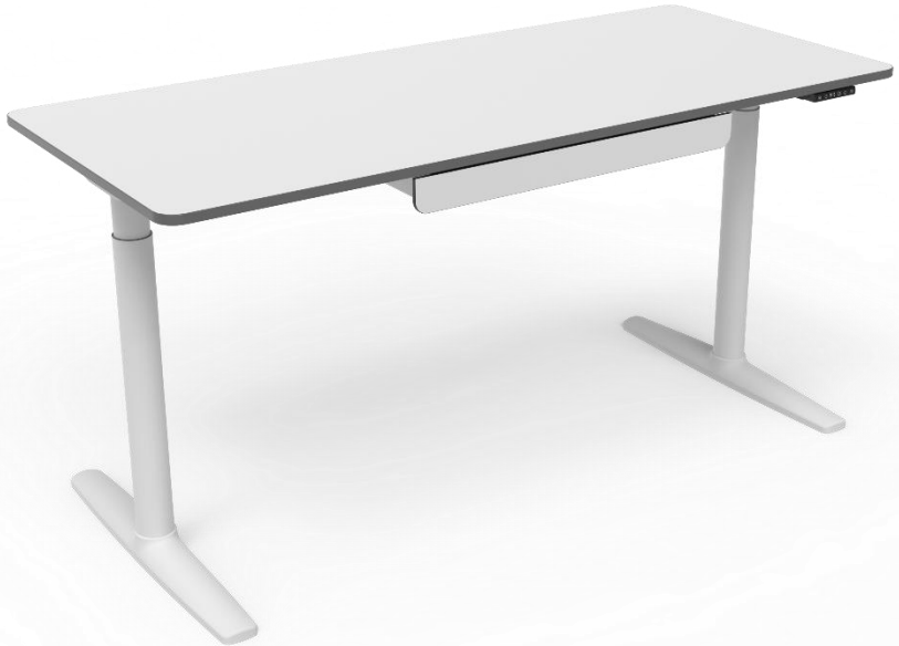
Drawer available as optional extra