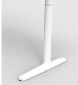
Two stage designer round columns with adjustable floor leveling pads